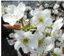
nashi (Jse pear):