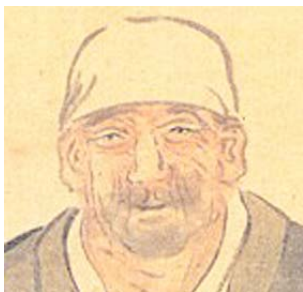
Matsuo Bashô (painted by Buson)